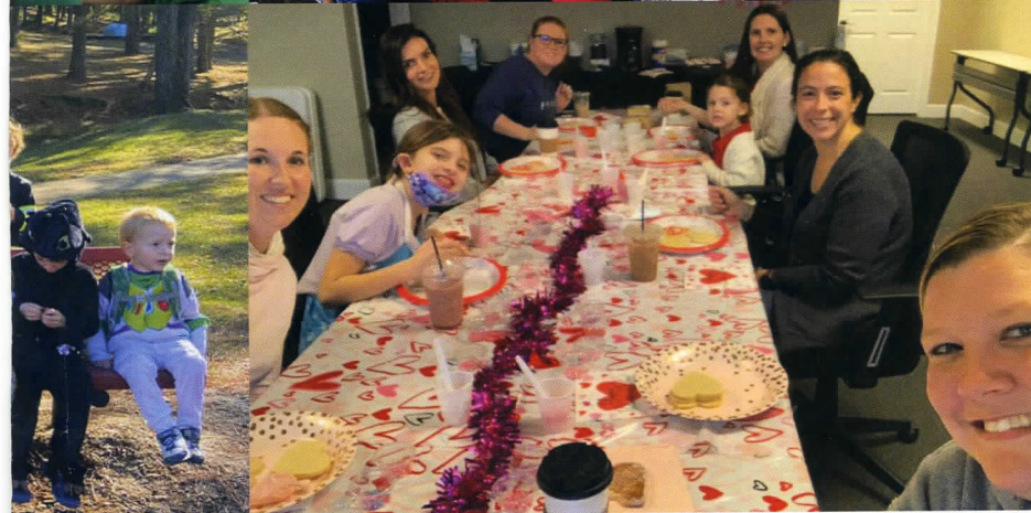
Deployed Love organizes a series of special events, including free photo sessions, for military families.

creating lasting memories among families from photo shoots to art projects, we hope to create happy memories during times that are often riddled with anxiety and the unexpected.